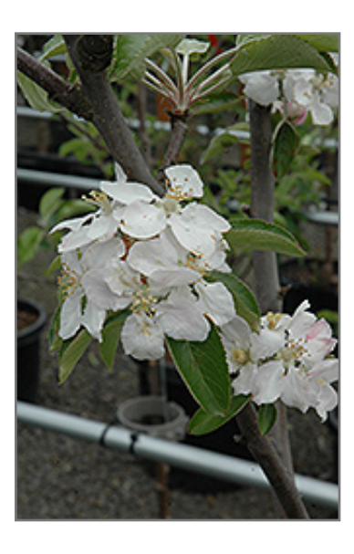
Spitzenburg Apple flowers

This is a deciduous tree with a shapely form and gracefully arching branches. Its average texture blends into the landscape, but can be balanced by one or two finer or coarser trees or shrubs for an effective composition. This is a high maintenance plant that will require regular care and upkeep, and is best pruned in late winter once the threat of extreme cold has passed. It is a good choice for attracting birds and bees to your yard. Gardeners should be aware of the following characteristic(s) that may warrant special consideration;