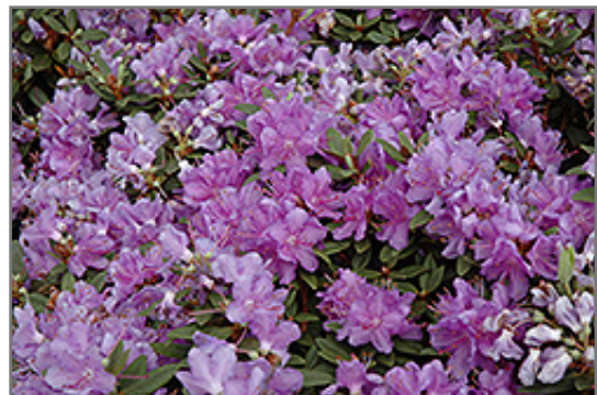
Purple Gem Rhododendron flowers