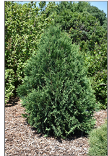
Technito Arborvitae