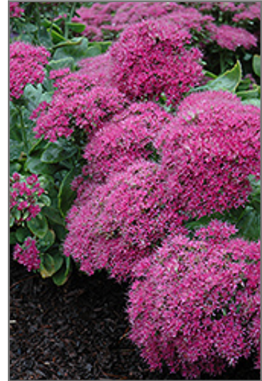
Neon Stonecrop flowers

Neon Stonecrop is a dense herbaceous perennial with an upright spreading habit of growth. Its relatively coarse texture can be used to stand it apart from other garden plants with finer foliage.