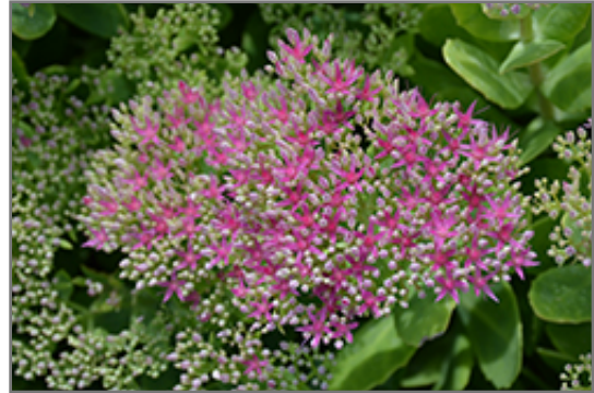
Neon Stonecrop flower buds