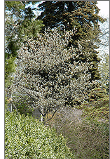
Allegheny Serviceberry in bloom