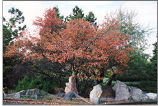
Allegheny Serviceberry in fall

This tree does best in full sun to partial shade. It prefers to grow in average to moist conditions, and shouldn't be allowed to dry out. It is not particular as to soil type or pH. It is somewhat tolerant of urban pollution. This species is native to parts of North America.