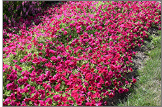
Wave Carmine Velour Petunia in bloom