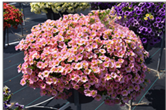
Superbells Honeyberry Calibrachoa in bloom

Ann Arbor 734-332-7900 155 N. Maple at Jackson