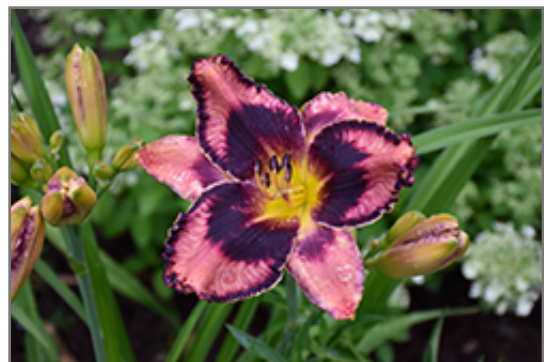
Rainbow Rhythm Storm Shelter Daylily flowers

Ann Arbor 734-332-7900 155 N. Maple at Jackson