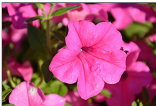
Surfinia Sumo Pink Petunia flowers

Surfinia Sumo Pink Petunia is a dense herbaceous annual with a trailing habit of growth, eventually spilling over the edges of hanging baskets and containers. Its medium texture blends into the garden, but can always be balanced by a couple of finer or coarser plants for an effective composition.