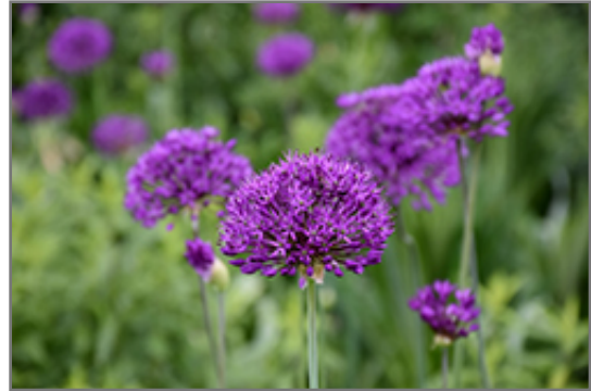
Purple Sensation Ornamental Onion flowers

Purple Sensation Ornamental Onion is an open herbaceous perennial with tall flower stalks held atop a low mound of foliage. Its relatively coarse texture can be used to stand it apart from other garden plants with finer foliage.