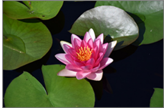
Attraction Hardy Water Lily flowers

Attraction Hardy Water Lily is ideally suited for growing in a pond, water garden or patio water container, and is recommended for the following landscape applications;