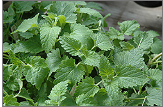
Catnip foliage