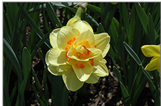
Tahiti Daffodil flowers