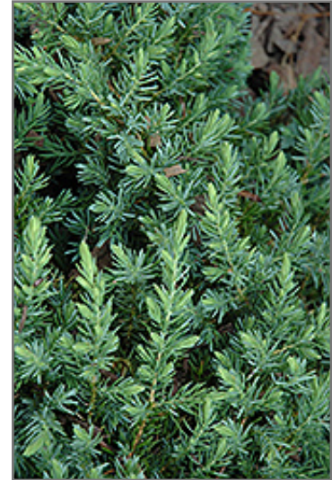
Blue Pacific Shore Juniper foliage