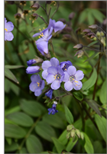
Heaven Scent Jacob's Ladder flowers

Heaven Scent Jacob's Ladder is a fine choice for the garden, but it is also a good selection for planting in outdoor pots and containers. With its upright habit of growth, it is best suited for use as a 'thriller' in the 'spiller-thriller-filler' container combination; plant it near the center of the pot, surrounded by smaller plants and those that spill over the edges. Note that when growing plants in outdoor containers and baskets, they may require more frequent waterings than they would in the yard or garden.