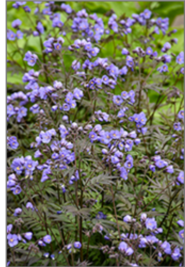
Heaven Scent Jacob's Ladder

Heaven Scent Jacob's Ladder is recommended for the following landscape applications;