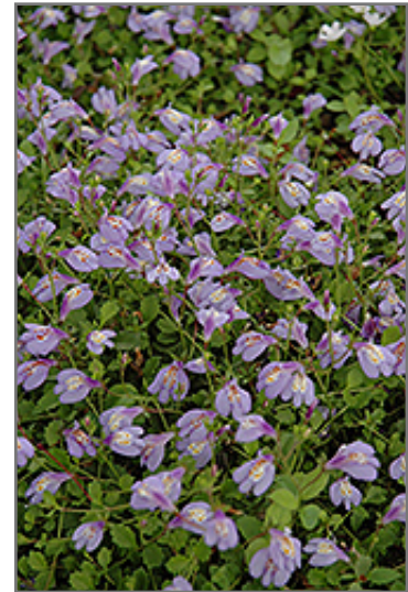
Creeping Mazus flowers