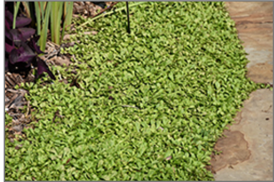
Creeping Mazus

Creeping Mazus will grow to be only 2 inches tall at maturity extending to 3 inches tall with the flowers, with a spread of 12 inches. Its foliage tends to remain low and dense right to the ground. It grows at a fast rate, and under ideal conditions can be expected to live for approximately 10 years. As an evergreen perennial, this plant will typically keep its form and foliage year-round.