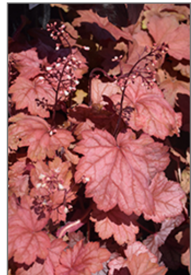
Georgia Peach Coral Bells in bloom

Ann Arbor 734-332-7900 155 N. Maple at Jackson