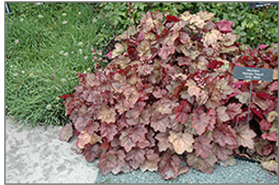
Georgia Peach Coral Bells

Georgia Peach Coral Bells is recommended for the following landscape applications;