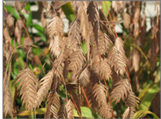
Northern Sea Oats fruit

Northern Sea Oats will grow to be about 4 feet tall at maturity, with a spread of 30 inches. Its foliage tends to remain dense right to the ground, not requiring facer plants in front. It grows at a medium rate, and under ideal conditions can be expected to live for approximately 10 years. As an herbaceous perennial, this plant will usually die back to the crown each winter, and will regrow from the base each spring. Be careful not to disturb the crown in late winter when it may not be readily seen!