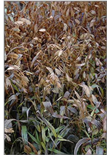
Northern Sea Oats in fall

Northern Sea Oats is recommended for the following landscape applications;