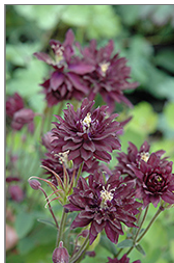
Clementine Dark Purple Columbine flowers