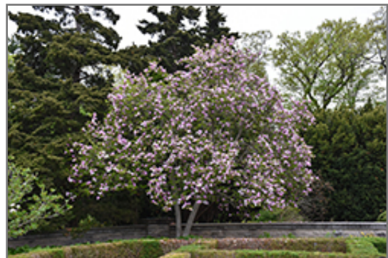
Jane Magnolia in bloom

Ann Arbor 734-332-7900 155 N. Maple at Jackson