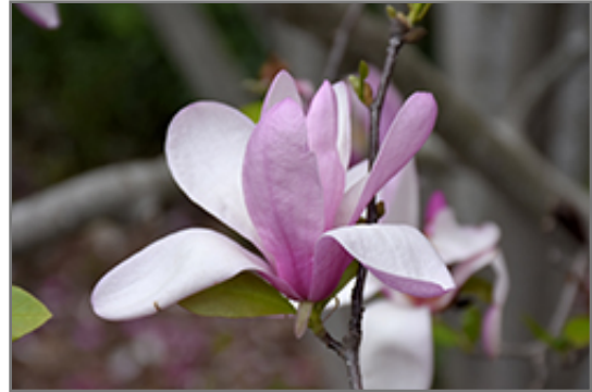
Jane Magnolia flowers

This shrub does best in full sun to partial shade. It requires an evenly moist well-drained soil for optimal growth, but will die in standing water. It is not particular as to soil type, but has a definite preference for acidic soils. It is quite intolerant of urban pollution, therefore inner city or urban streetside plantings are best avoided. Consider applying a thick mulch around the root zone in winter to protect it in exposed locations or colder microclimates. This particular variety is an interspecific hybrid.