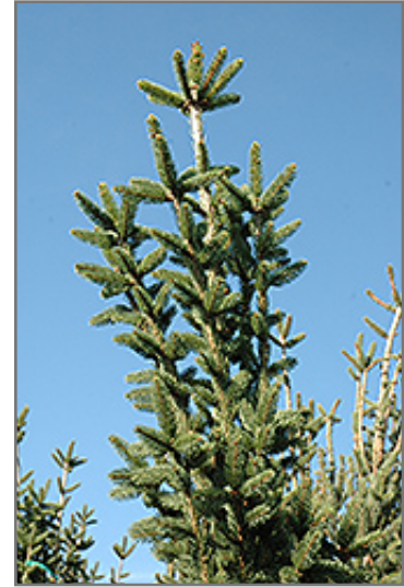
Columnar Norway Spruce foliage