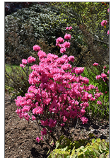
Landmark Rhododendron in bloom