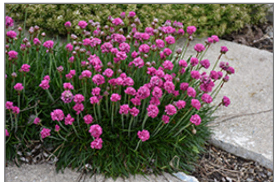
Bloodstone Sea Thrift in bloom

Ann Arbor 734-332-7900 155 N. Maple at Jackson