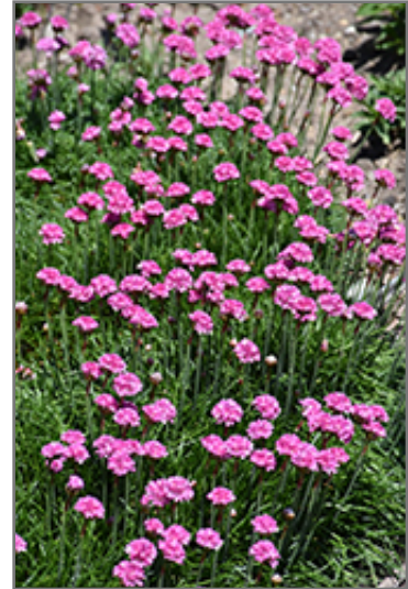
Bloodstone Sea Thrift in bloom

Bloodstone Sea Thrift is a fine choice for the garden, but it is also a good selection for planting in outdoor pots and containers. It is often used as a 'filler' in the 'spiller-thriller-filler' container combination, providing a mass of flowers against which the thriller plants stand out. Note that when growing plants in outdoor containers and baskets, they may require more frequent waterings than they would in the yard or garden.