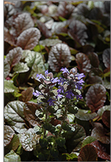
Purple Brocade Bugleweed flowers

Purple Brocade Bugleweed is recommended for the following landscape applications;