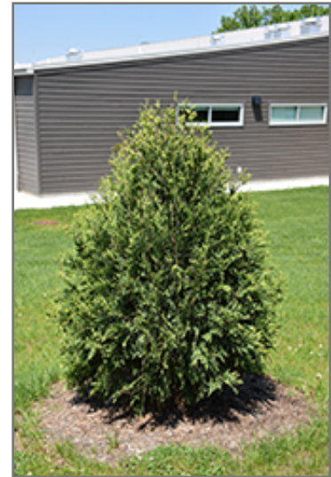
Technito Arborvitae