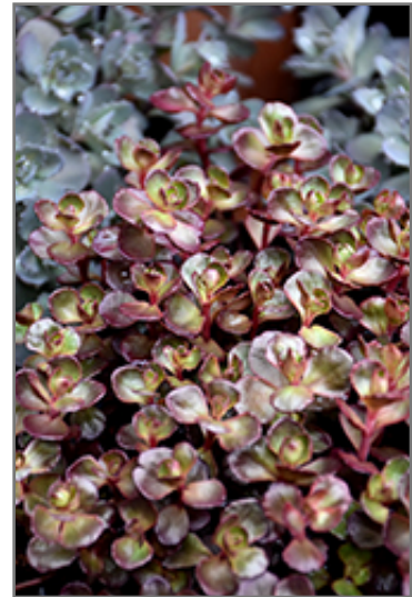
Voodoo Stonecrop foliage

Voodoo Stonecrop is recommended for the following landscape applications;