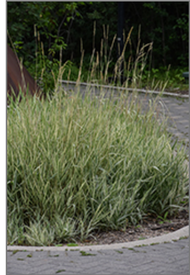
Strawberries And Cream Ribbon Grass in bloom