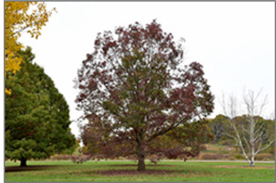
White Oak in fall

White Oak will grow to be about 90 feet tall at maturity, with a spread of 70 feet. It has a high canopy of foliage that sits well above the ground, and should not be planted underneath power lines. As it matures, the lower branches of this tree can be strategically removed to create a high enough canopy to support unobstructed human traffic underneath. It grows at a slow rate, and under ideal conditions can be expected to live to a ripe old age of 300 years or more; think of this as a heritage tree for future generations!