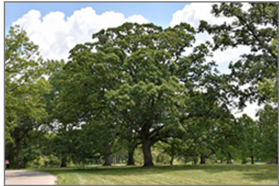
White Oak