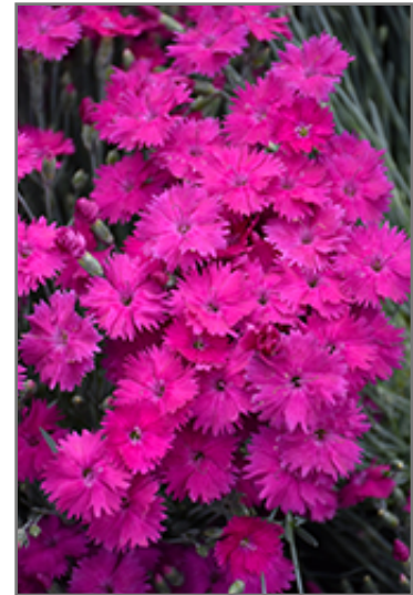
Neon Star Pinks flowers

This is a relatively low maintenance plant, and is best cleaned up in early spring before it resumes active growth for the season. It is a good choice for attracting bees and butterflies to your yard, but is not particularly attractive to deer who tend to leave it alone in favor of tastier treats. It has no significant negative characteristics.