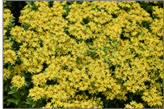
Rock 'N Round Bright Idea Stonecrop flowers

Rock 'N Round Bright Idea Stonecrop is a dense herbaceous perennial with a mounded form. Its medium texture blends into the garden, but can always be balanced by a couple of finer or coarser plants for an effective composition.