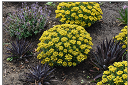
Rock 'N Round Bright Idea Stonecrop in bloom

Ann Arbor 734-332-7900 155 N. Maple at Jackson