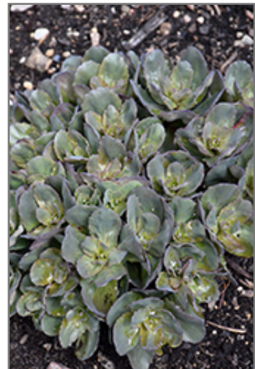
Rock 'N Grow Back in Black Stonecrop foliage

Ann Arbor 734-332-7900 155 N. Maple at Jackson