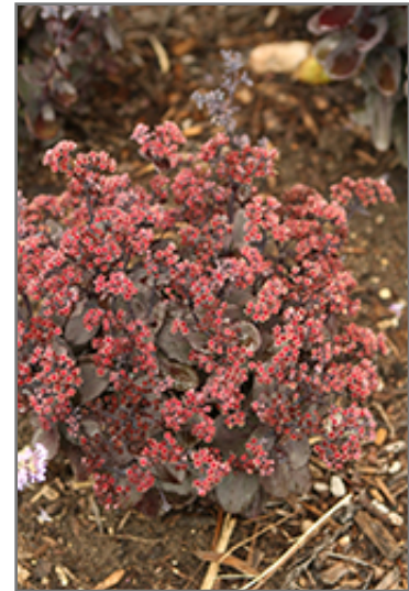
Rock 'N Grow Back in Black Stonecrop flowers

Rock 'N Grow Back in Black Stonecrop is a fine choice for the garden, but it is also a good selection for planting in outdoor pots and containers. With its upright habit of growth, it is best suited for use as a 'thriller' in the 'spiller-thriller-filler' container combination; plant it near the center of the pot, surrounded by smaller plants and those that spill over the edges. Note that when growing plants in outdoor containers and baskets, they may require more frequent waterings than they would in the yard or garden.