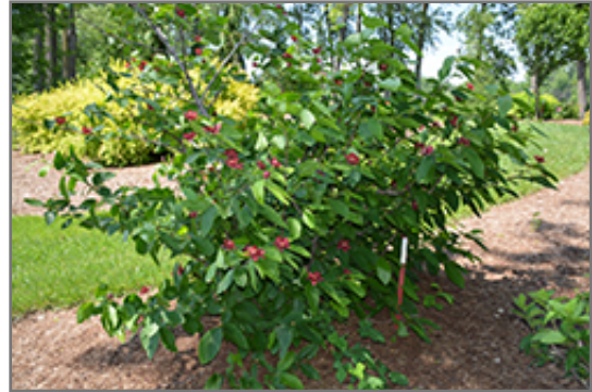
Simply Scentsational Sweetshrub in bloom

Simply Scentsational Sweetshrub will grow to be about 6 feet tall at maturity, with a spread of 5 feet. It tends to fill out right to the ground and therefore doesn't necessarily require facer plants in front, and is suitable for planting under power lines. It grows at a medium rate, and under ideal conditions can be expected to live for approximately 20 years.