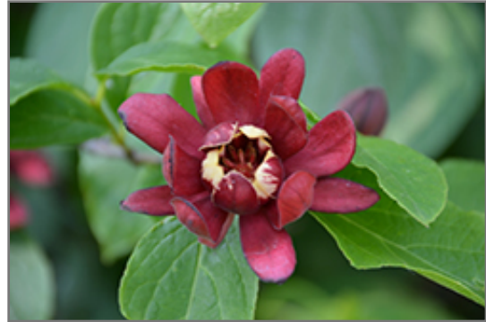
Simply Scentsational Sweetshrub flowers

Simply Scentsational Sweetshrub is recommended for the following landscape applications;