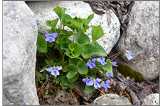
Woolly Blue Violet in bloom

Woolly Blue Violet will grow to be only 4 inches tall at maturity extending to 6 inches tall with the flowers, with a spread of 6 inches. When grown in masses or used as a bedding plant, individual plants should be spaced approximately 5 inches apart. Its foliage tends to remain low and dense right to the ground. It grows at a fast rate, and under ideal conditions can be expected to live for approximately 3 years. As an herbaceous perennial, this plant will usually die back to the crown each winter, and will regrow from the base each spring. Be careful not to disturb the crown in late winter when it may not be readily seen!