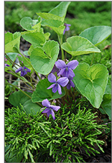
Wooly Blue Violet flowers

Wooly Blue Violet is recommended for the following landscape applications;