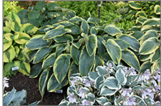
Shadowland Wu-La-La Hosta

Shadowland Wu-La-La Hosta is a dense herbaceous perennial with a mounded form. Its medium texture blends into the garden, but can always be balanced by a couple of finer or coarser plants for an effective composition.