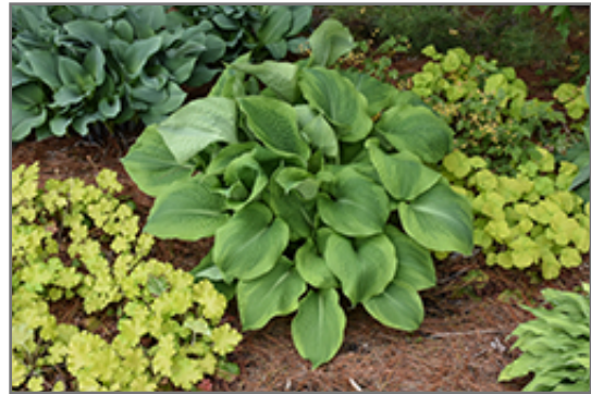
Twin Cities Hosta

Twin Cities Hosta is recommended for the following landscape applications;