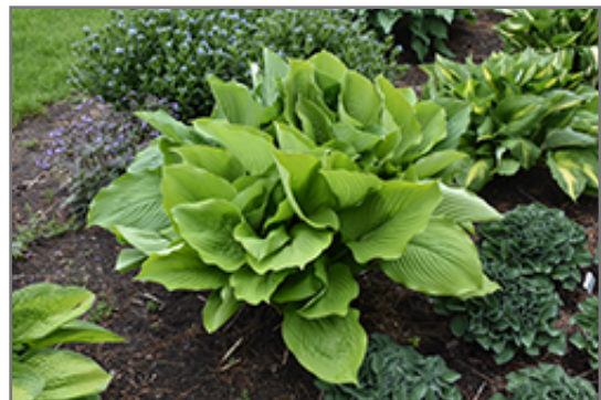
Age of Gold Hosta

Ann Arbor 734-332-7900 155 N. Maple at Jackson