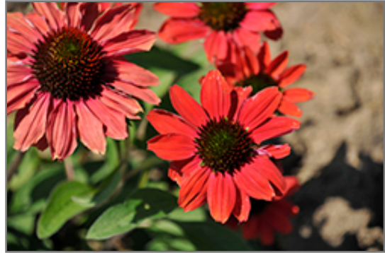
Color Coded Frankly Scarlet Coneflower flowers