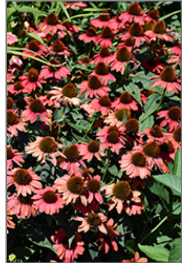
Color Coded Frankly Scarlet Coneflower flowers

Color Coded Frankly Scarlet Coneflower is an herbaceous perennial with an upright spreading habit of growth. Its medium texture blends into the garden, but can always be balanced by a couple of finer or coarser plants for an effective composition.