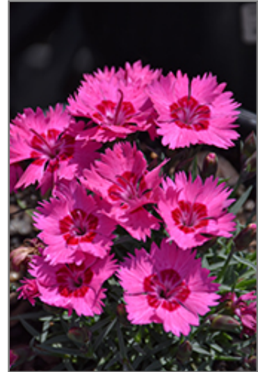
Paint The Town Fancy Pinks flowers

Paint The Town Fancy Pinks is a fine choice for the garden, but it is also a good selection for planting in outdoor pots and containers. It is often used as a 'filler' in the 'spiller-thriller-filler' container combination, providing a mass of flowers and foliage against which the thriller plants stand out. Note that when growing plants in outdoor containers and baskets, they may require more frequent waterings than they would in the yard or garden.