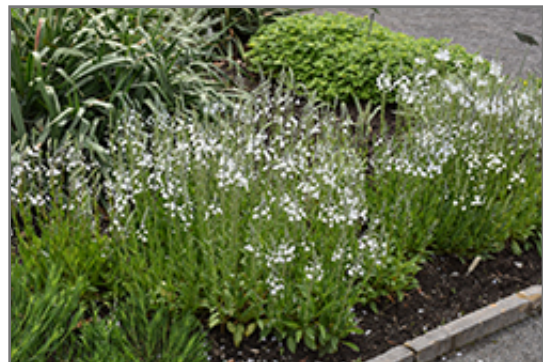
Gentian Speedwell flowers