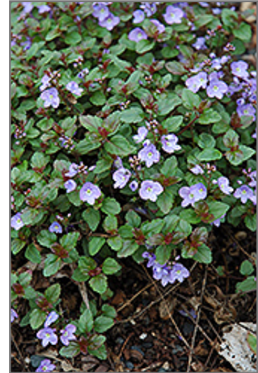
Waterperry Blue Speedwell in bloom