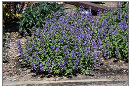
Picture Purrfect Catmint in bloom

Ann Arbor 734-332-7900 155 N. Maple at Jackson