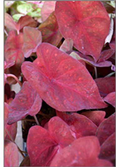
Burning Heart Caladium foliage

Burning Heart Caladium is recommended for the following landscape applications;