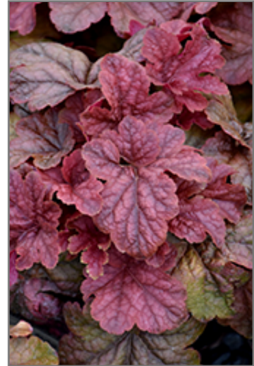
Peach Tea Foamy Bells foliage

Peach Tea Foamy Bells is recommended for the following landscape applications;