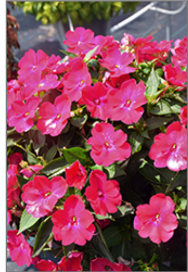
SunPatiens Compact Rose Glow New Guinea Impatiens flowers

SunPatiens Compact Rose Glow New Guinea Impatiens is a fine choice for the garden, but it is also a good selection for planting in outdoor containers and hanging baskets. It can be used either as 'filler' or as a 'thriller' in the 'spiller-thriller-filler' container combination, depending on the height and form of the other plants used in the container planting. It is even sizeable enough that it can be grown alone in a suitable container. Note that when growing plants in outdoor containers and baskets, they may require more frequent waterings than they would in the yard or garden.