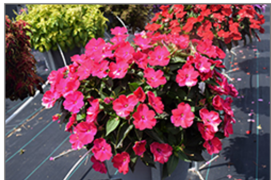
SunPatiens Compact Rose Glow New Guinea Impatiens in bloom

Ann Arbor 734-332-7900 155 N. Maple at Jackson