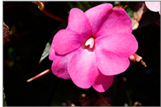
SunPatiens Compact Hot Pink New Guinea Impatiens flowers

SunPatiens Compact Hot Pink New Guinea Impatiens is recommended for the following landscape applications;