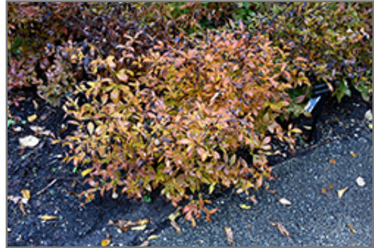
Bowman's Root in fall

Bowman's Root will grow to be about 30 inches tall at maturity, with a spread of 24 inches. Its foliage tends to remain dense right to the ground, not requiring facer plants in front. It grows at a medium rate, and under ideal conditions can be expected to live for approximately 10 years. As an herbaceous perennial, this plant will usually die back to the crown each winter, and will regrow from the base each spring. Be careful not to disturb the crown in late winter when it may not be readily seen!