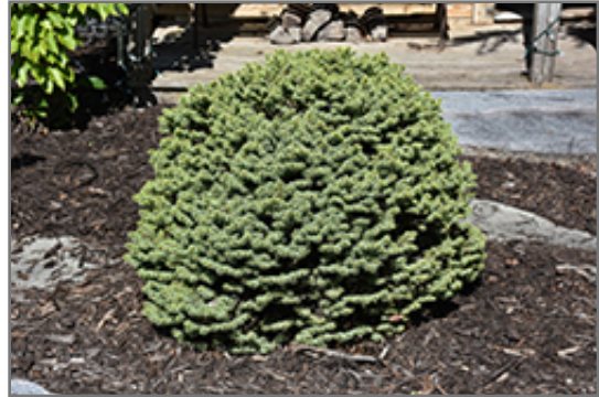
Dwarf Serbian Spruce