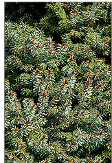
Dwarf Serbian Spruce foliage

Ann Arbor 734-332-7900 155 N. Maple at Jackson