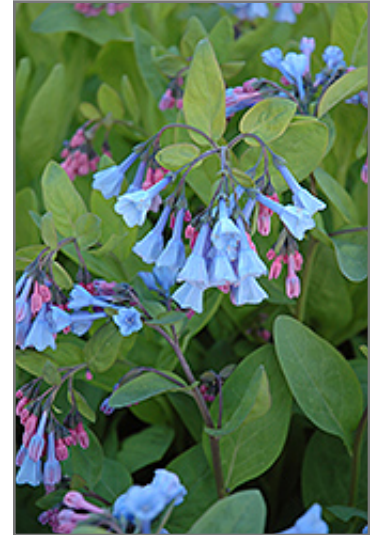
Virginia Bluebells flowers