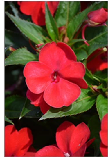
SunPatiens Vigorous Red Impatiens flowers

SunPatiens Vigorous Red Impatiens is a fine choice for the garden, but it is also a good selection for planting in outdoor containers and hanging baskets. Because of its height, it is often used as a 'thriller' in the 'spiller-thriller-filler' container combination; plant it near the center of the pot, surrounded by smaller plants and those that spill over the edges. It is even sizeable enough that it can be grown alone in a suitable container. Note that when growing plants in outdoor containers and baskets, they may require more frequent waterings than they would in the yard or garden.