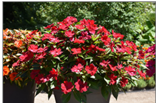
SunPatiens Vigorous Red Impatiens in bloom