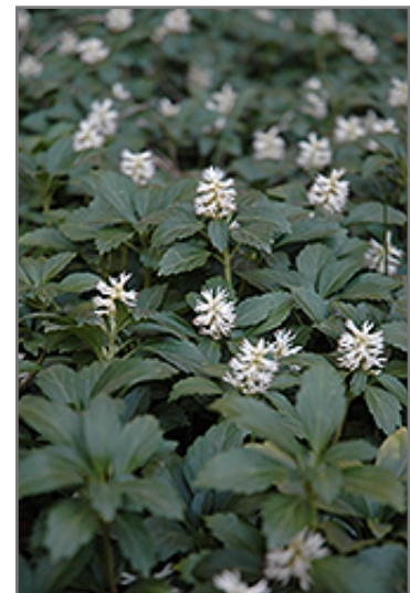
Japanese Spurge flowers